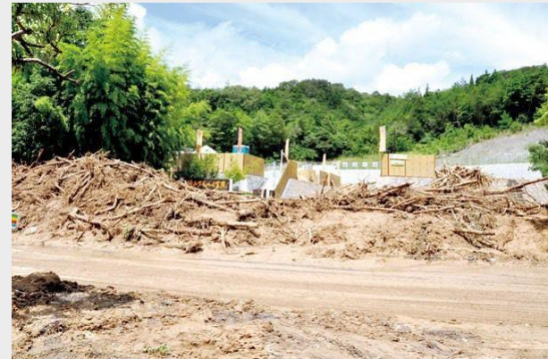
Landslide by torrential rain in July, 2018 near the Higashiroshima campus

Natural disasters actually occurred in the neighboring areas