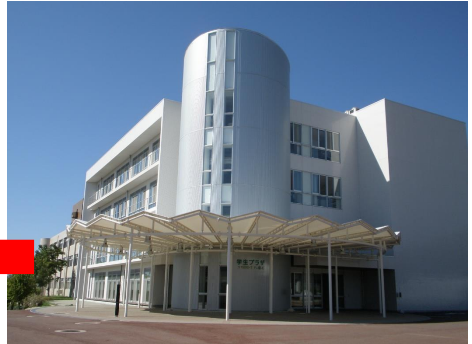
Student Plaza 4F